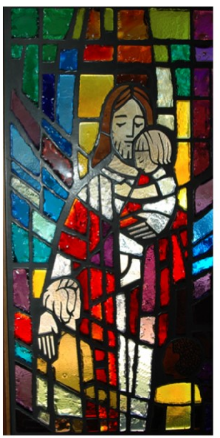
October 6, 2024

email: ihumc66207@qmail.com indianheightsumc.org Office: (913) 649-9040